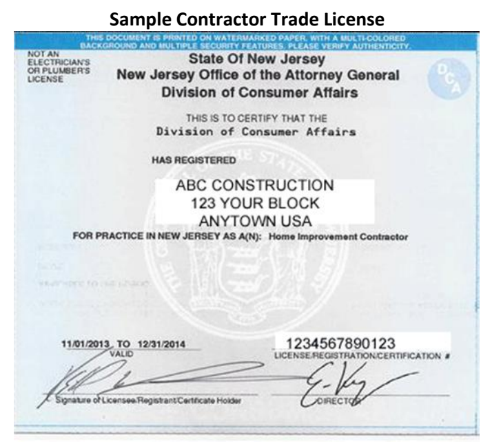
<u>CONTRACTOR'S REGISTRATION EVIDENCE</u> — "Public Works Contractor Registration Act"

All bidders are to submit with their proposal all current, valid contractor or trade licenses as issued by the New Jersey Division of Consumer Affairs, for any trade or specialty area the contractor seeks to perform work for this particular proposal.