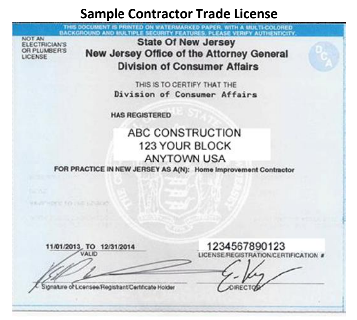
<u>CONTRACTOR'S REGISTRATION EVIDENCE</u> — "Public Works Contractor Registration Act"

All bidders are to submit with their proposal all current, valid contractor or trade licenses as issued by the New Jersey Division of Consumer Affairs, for any trade or specialty area the contractor seeks to perform work for this particular proposal.